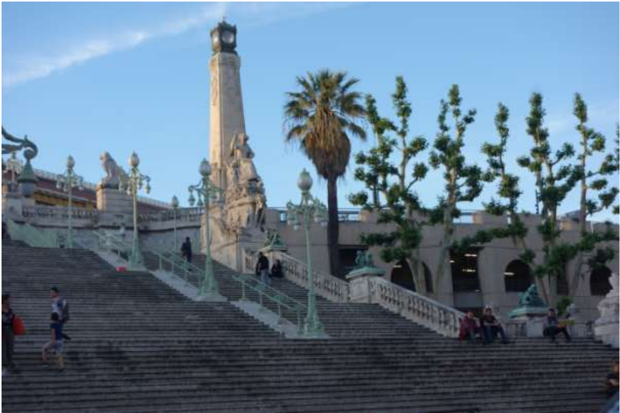
Auf der Rückreise