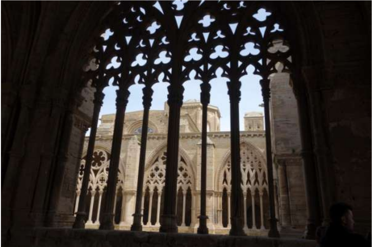
Am Fluss Segre