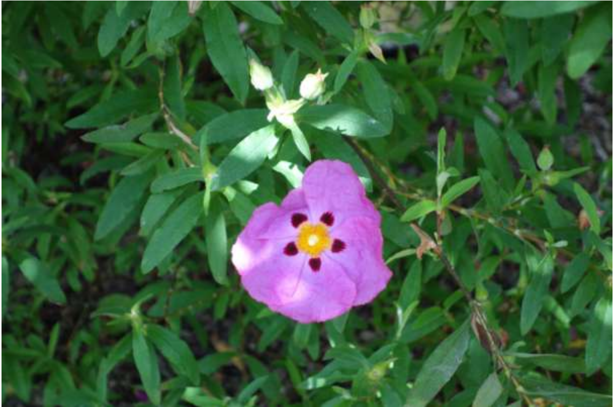
Szenen an der Atlantikküste