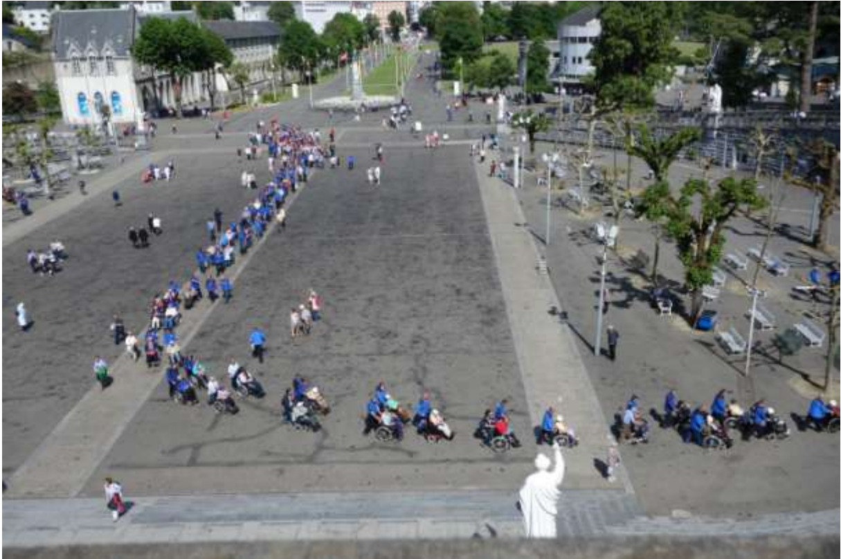
Chateaux de Lourdes