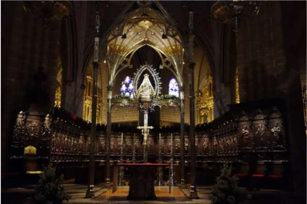
Abendstimmung in Pamplona